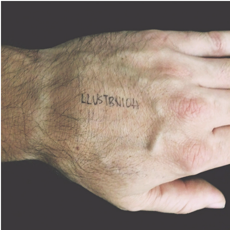
No Bullshit , 2014, Archival inkjet print, 50 x 50cm ^ The Break Through , 2014, Archival inkjet print, 112 x 155cm >